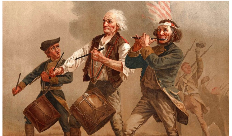
Archibald Willard's painting "Spirit of 76" depicts drummers and fifers in the Revolutionary War.

Traditional military field music in the United States is older than the nation itself, as it arrived with the first colonists and was used much in the same way it had been in Europe: to signal a call to arms to the local militias. Military drummers and fifers played important roles in both the Revolutionary and American Civil Wars, as musical instruments were the most effective ways to communicate and convey orders to troops in a chaotic environment. In the Civil War, they even began signaling orders for daily tasks like when to wake up, mealtimes, and the end of the day.