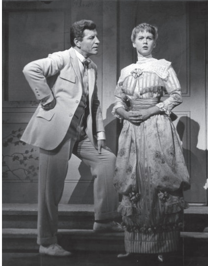
Robert Preston and Barbara Cook in the original Broadway production.

There have been several revivals of the show in New York, including two brief runs at New York City Center in 1965 and 1980, but most notable is the 2000 Broadway revival, which was directed and choreographed by Susan Stroman and starred Craig Bierko and Rebecca Luker. In 2003, a television movie was made of the show, which starred Matthew Broderick as Harold Hill and Kristin Chenoweth as Marian.