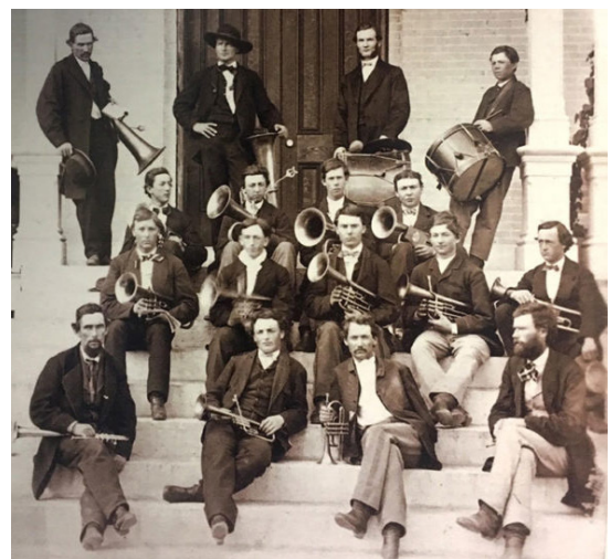
The University of Notre Dame Band

During peacetime, military bands were most prominently employed for public ceremonies and special occasions, and it was during one such period that the first college band was formed in the United States. In 1846, the University of Notre Dame band played at the university's first graduation ceremony, only four years after the institution's founding. Music lessons were an integral part of the curriculum from the first days of the university in 1842, and the band continues to be a point of pride for the Fighting Irish today as the oldest college band in continuous existence in the country. Similarly to the military bands of the time, the university band played for special occasions and ceremonies, but the marching band identity as we know it today emerged with the advent of organized football. While the first recognized game was in 1875 at Harvard University, Notre Dame played its first game in 1887 and was accompanied by the university band, which has not missed a home game since. Twenty years later in 1907, the University of Illinois band staged the first modern half-time show with a robust marching band taking the field. The practice took off at colleges around the country and is now a staple of home football games.