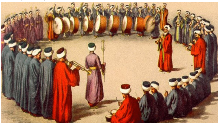
An Ottoman Mehter Band

Today in the United States, marching band music conjures images of pep rallies, football games, color guard dancers, and lively parades, but modern marching bands can actually be traced to Turkish military drum corps formed over two thousand years ago. These drummers, whose group eventually developed into a full band and was later named the Mehter Band under the Ottoman Empire (14th – 20th centuries), would march with the military bearing their flag and ensign as a signal of support for the soldiers as well as a celebration of victory. Through their military conquests, these Turkish bands spread their traditions from Central Asia to Asia Minor and eventually the Islamic states. The Mehter Band continues to play concerts and ceremonies in Turkey today and is the oldest band in the world.