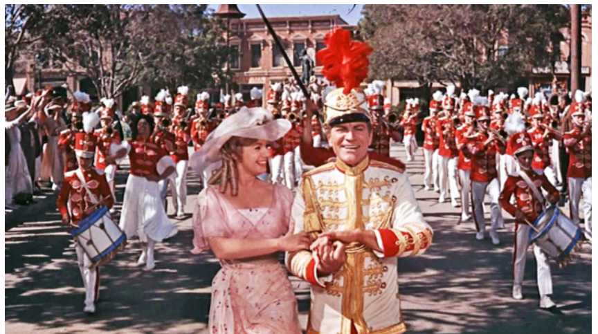
Shirley Jones and Robert Preston in the 1962 film adaptation.