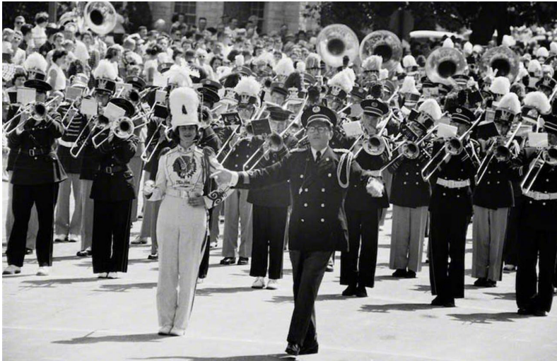
Meredith Willson leads 76 trombones in a big parade.

By 1951, Meredith Willson had become somewhat of a household name due to his appearances on television and radio, and he had developed a reputation as an affable, well-meaning Midwesterner with a point of view